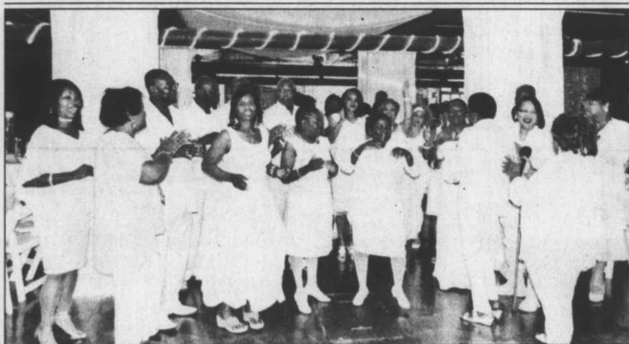
The Class celebrates their birthdays with a dance.

The application process for the scholarship includes submission of an essay discussing one of three possible topics along with two letters of recommendation, one from a teacher or counselor, and one from a supervisor or community leader.