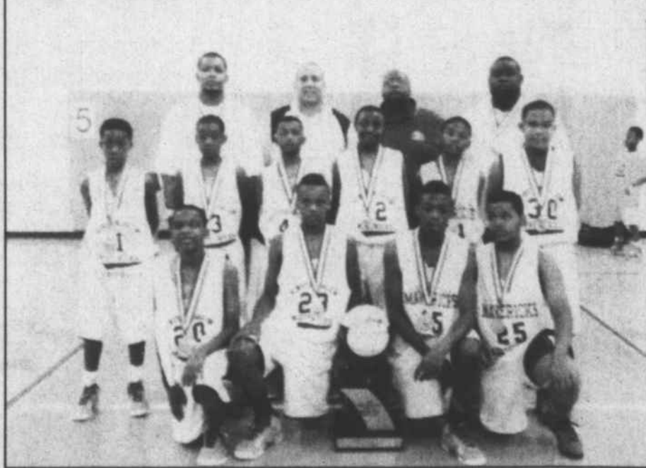
The team poses with coaches.

For more information on the event, visit NWALegends.com.