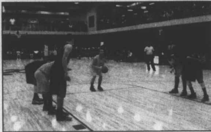
A packed house watches last week's showdown.