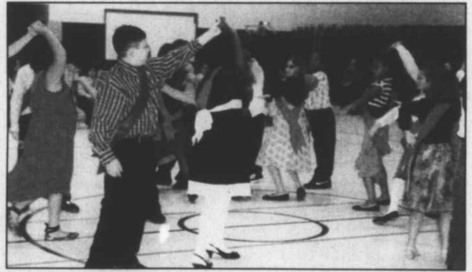
Children learn dance moves during a Take the Lead session.