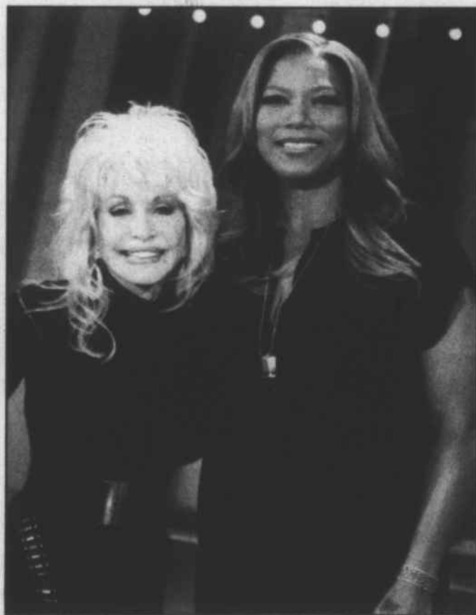
Singer/actress Dolly Parton poses with rapper/singer/actress Queen Latifah last month on the set of Latifah's new daytime talk show. Parton was a guest on the Oct. 21 show. Parton and Latifah starred together in the 2012 film, "Joyful Noise."