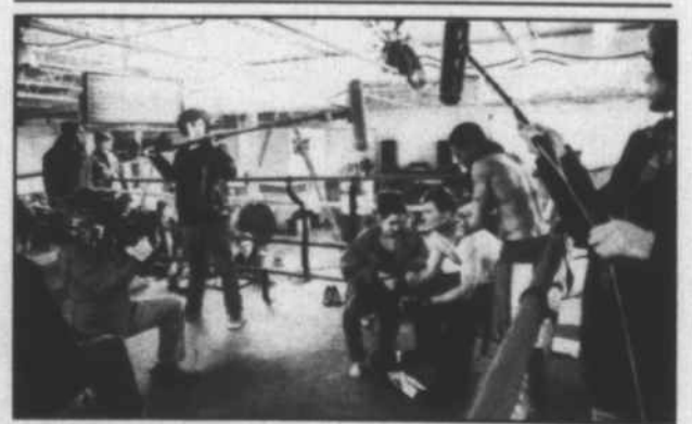
Filmmakers and actors on the set of "Title Fight."