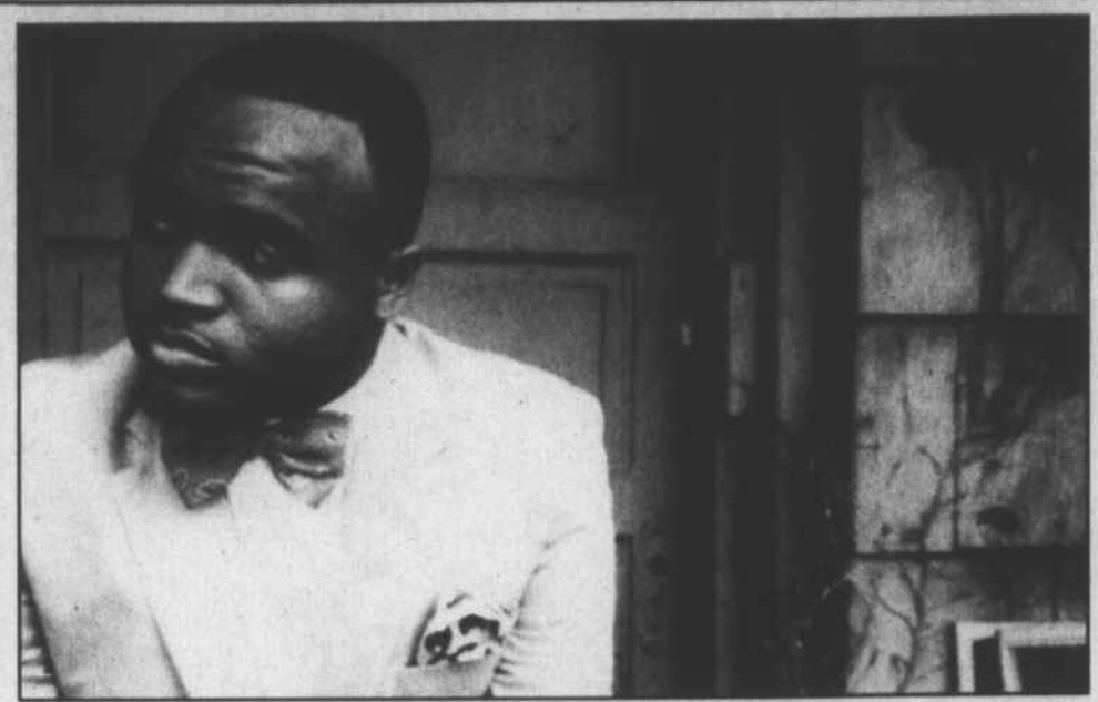
Showcase of Praise

A fellowship dinner was held after the service. Southside Baptist Church, 401 E. Sprague St., will host a third anniversary celebration for its Men's Choir at 3 p.m.