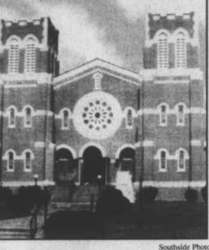
Southside Baptist Church hosted the recent unity event.