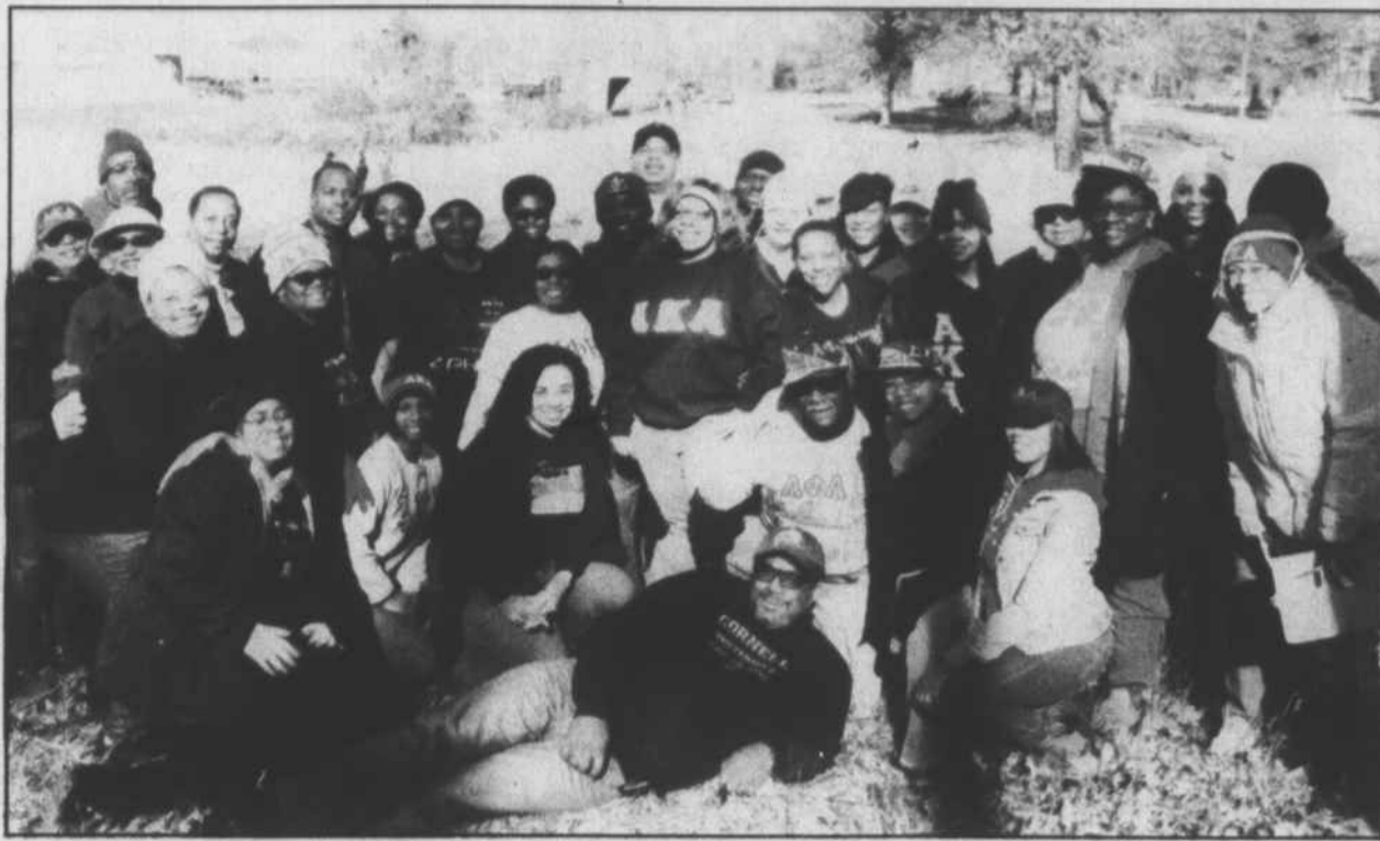
Dozens of Pan-Hellenic Council members took part in the effort.