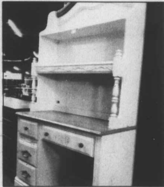
WS Rescue Mission Photo

The Thrift Store is located at 715 N. Cherry St.