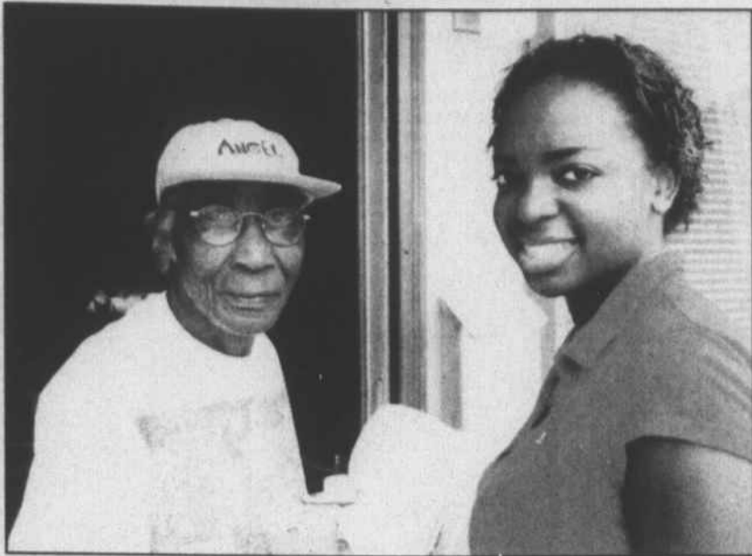
Senior Services Photo