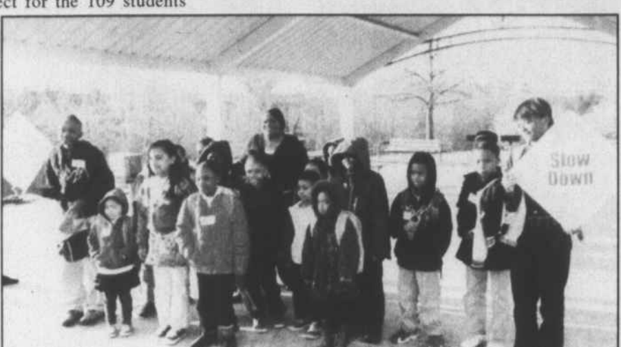
Some of the students who recently walked to Kimberley Park.

The diabetes drug, ACTOSs, has been linked to an increased risk of bladder cancer. If you or a loved one has been diagnosed with bladder cancer after taking ACTOSs, ACTOplus mets, ACTOplus mets XR or duetacts, call us now about making a claim for substantial monetary compensation. No fees or costs until your case settles. We practice law only in Arizona, but associate with lawyers throughout the U.S. GOLDBERG & OSBORNE OCCUPATION OF THE PROBLE (1-800-843-3245) WWW.1800fheeagle.com