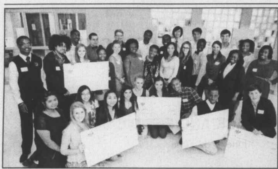
Youth Grantmakers in Action members with grant winners pose.