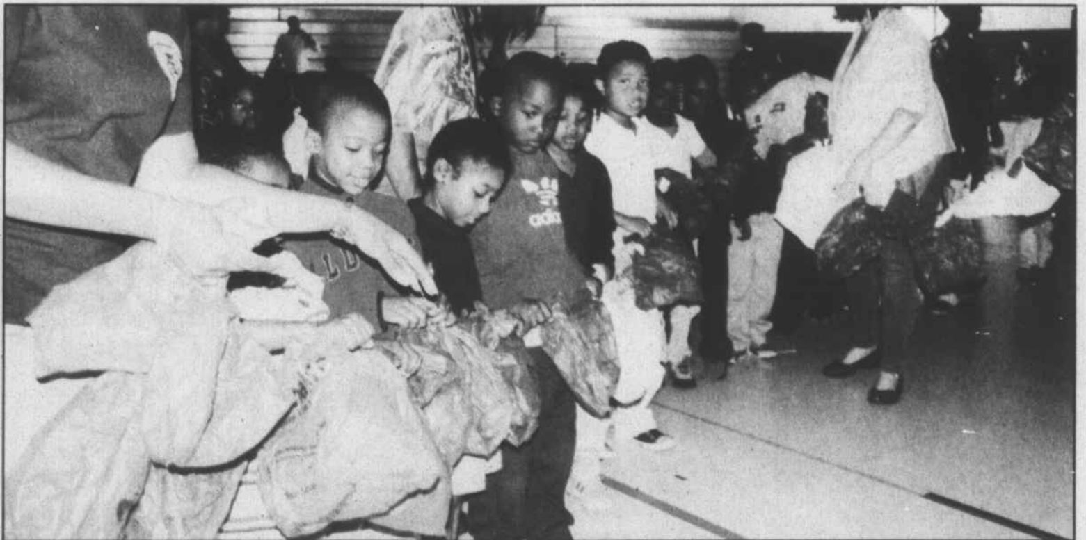
Students prepare to take the chain outdoors.