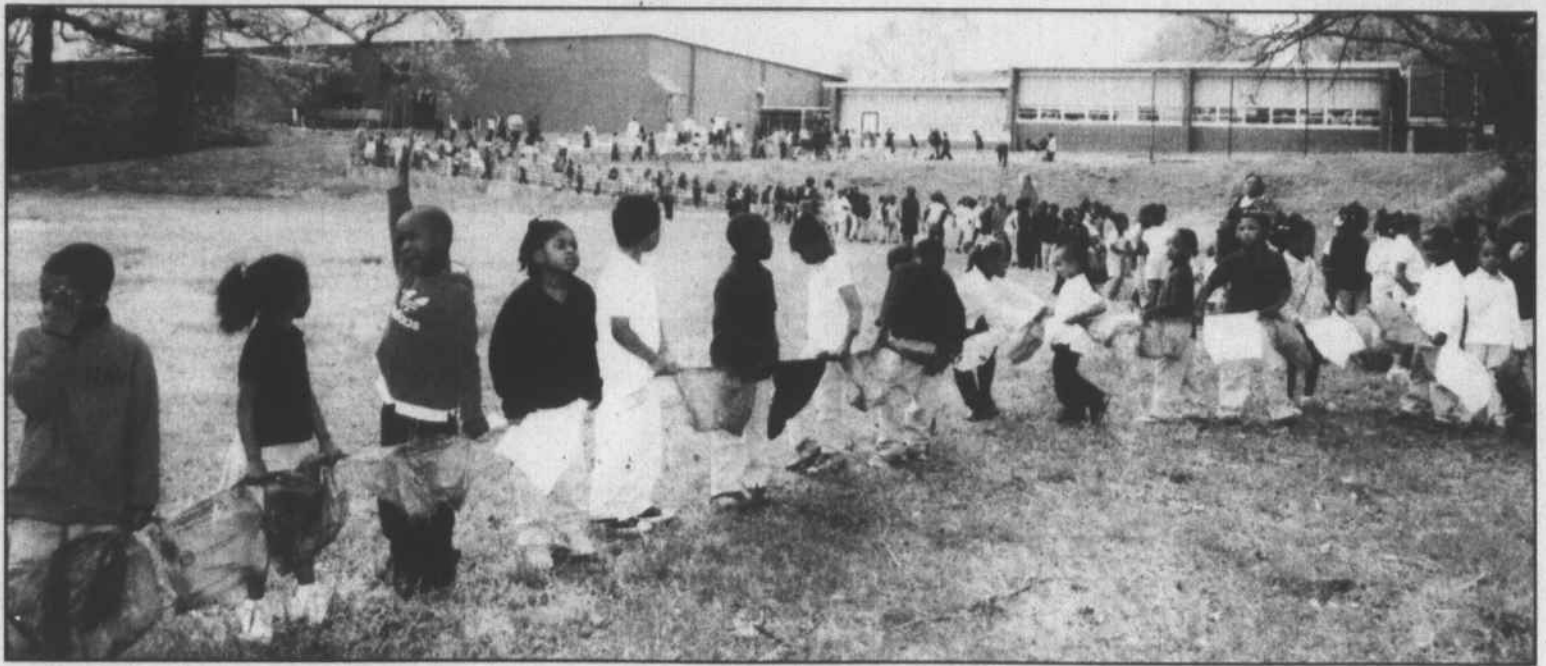
Hundreds of students take part in the Earth Day demonstration.