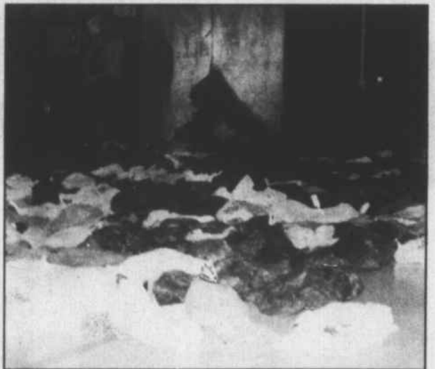
Students collected over 1,000 bags for the project.