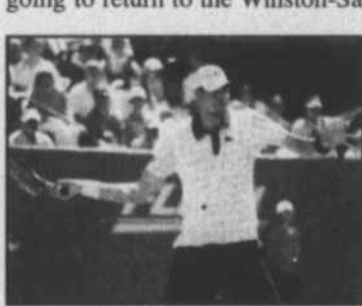
WS Open Photo