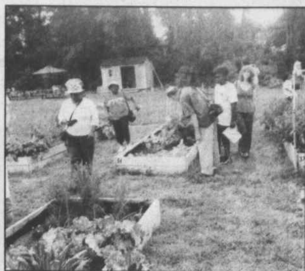
A view of some of the garden beds at Simon's Community Gardens.

"We do talk about anti-bullying, and there are gangs in Winston-Salem," Snyder said.