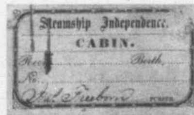
Rare ticket from the Steamship Independence which burnt at sea in Spring of 1853. Over 300 passengers and crew lost their lives.

While there are no hard or fast rules for what you chose to keep or store, remember that you are keeping alive memories and history for future generations to enjoy!