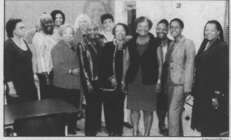
The women of the ACEY Group.

From the start, the ACEY group, was committed to doing more than just collecting money. They adopted a group mission to seek out and implement ways to meaningfully impact lives. That dedication has resulted in the group undertaking projects such as providing summer camp scholarships to girls, providing items and programs for seniors and providing programming for young girls transitioning through foster care. The group has hosted a conference for young girls and supported other non-profits. While these activities are not officially required for Women's Fund membership, ACEY group