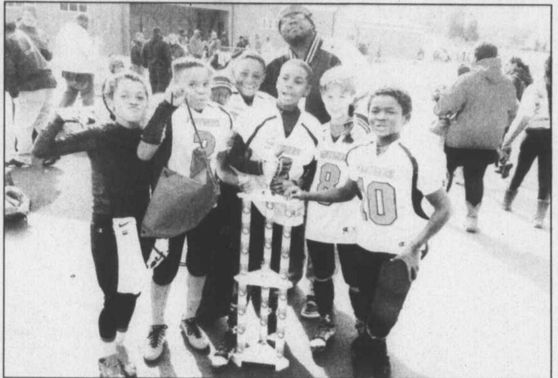
The Panthers Cadets celebrate after winning the A.Y.F. State Championship game.