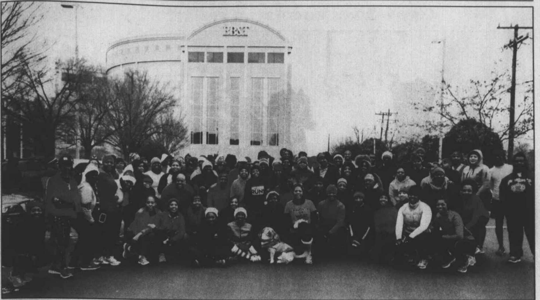
Local Black Girls Run! members and supporters pose at a Dec. 20 5K run.