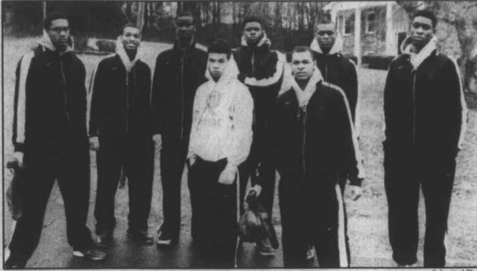
The team poses while cleaning Parrish Road.

The Fighting Pharaohs are not only busy on the court but also in the commu-