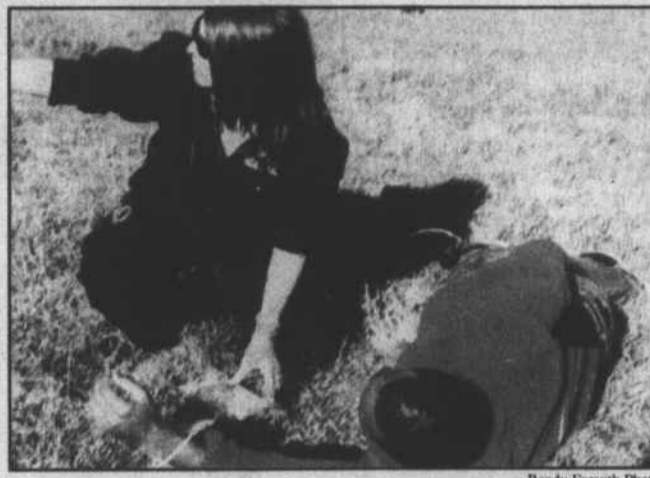
Ready Forsyth Photo

Training will be held from 8 a.m. through 5 p.m. at Fire Station 7 at 100