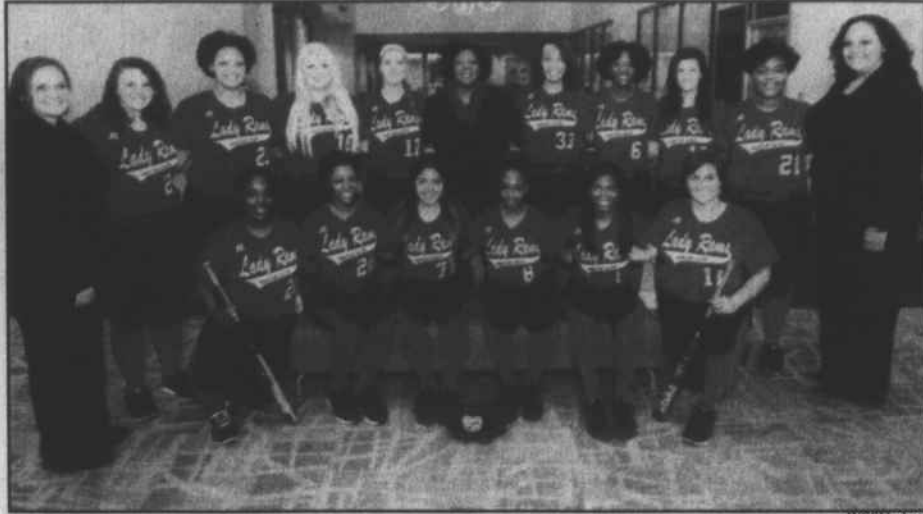
The Winston-Salem State Lady Rams opened their season on Saturday, Jan. 31.

The Lady Rams scored in the third inning when