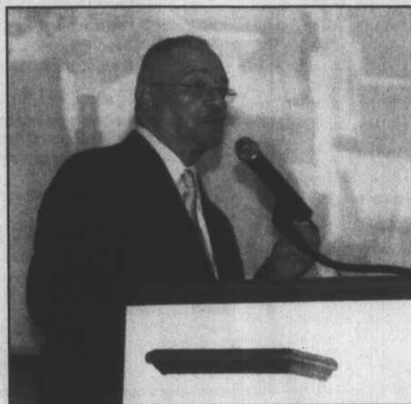
The Rev. Jeremiah Wright, President Obama's former pastor, speaks briefly as a special guest at the NAACP Voting Rights Ecumenical Service on Sunday, July 12.