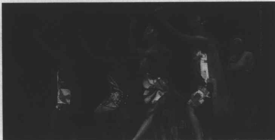
The women of "The Amazing Adventures of Grace May B. Brown."