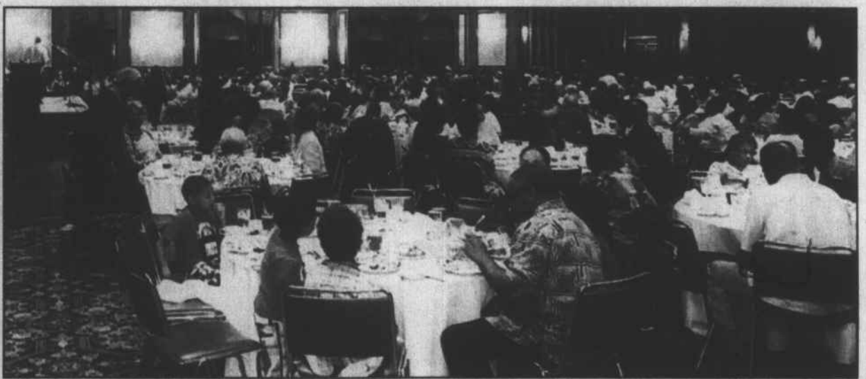
A banquet on Monday evening is part of The Lott Carey Global Missional Community's annual convention this week.