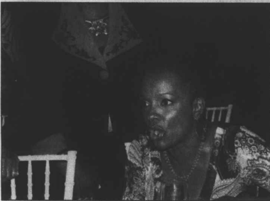
Actress Vanessa Bell Calloway, who portrayed Zora Neale Hurston in "Letters from Zora: In Her Own Words," talks with people at the reception.