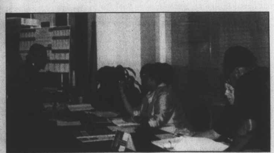
Volunteers work at the NBTF Information Desk in the lobby of the Marriott Hotel in downtown Winston-Salem on Monday, Aug. 3.