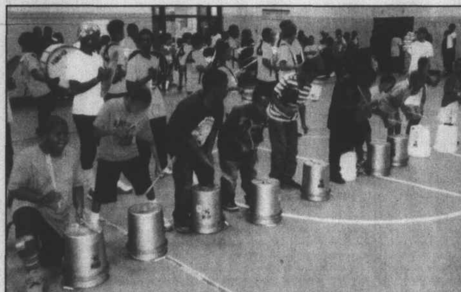
The young drum line from the Justice Marathon Funtime Adventure Camp entertains the crowd on buckets at the back-to-school cookout.