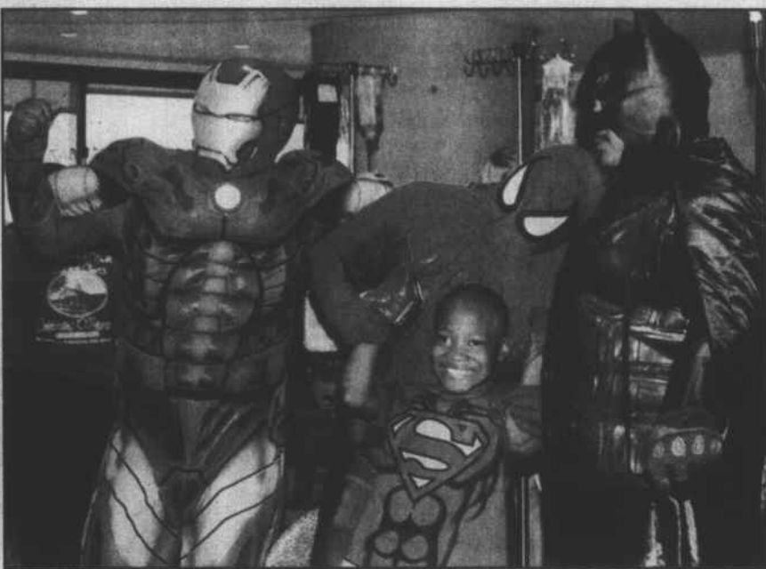
Superheroes, who are commercial window washers, mingle with patients of Brenner Children's Hospital one recent morning.