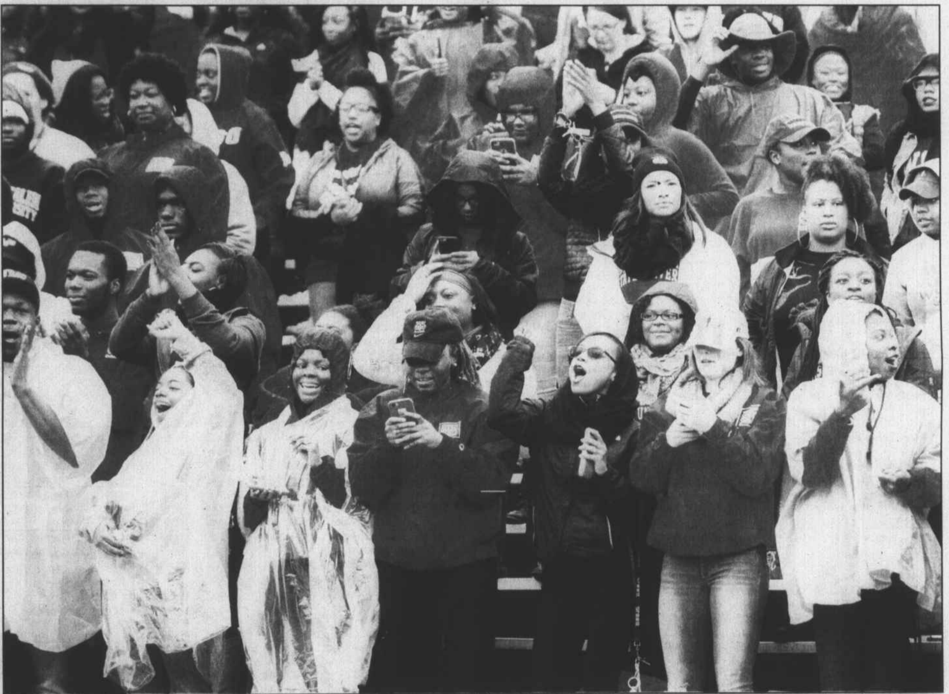
The crowd cheers for Winston-Salem State University's football team in Bowman Gray Stadium on Saturday, Oct. 3, as it attempted unsuccessfully to beat Chowan University in the university's first home game of the season.