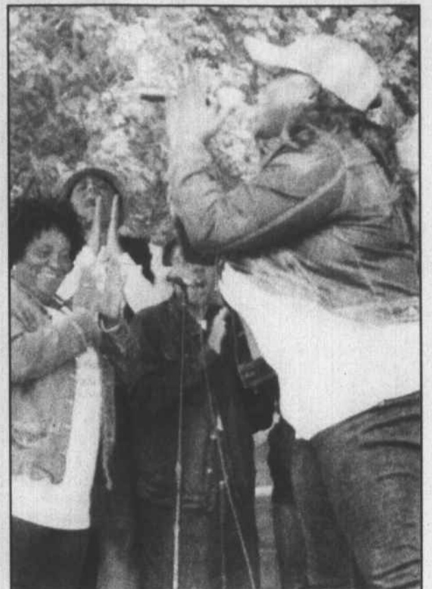
The JH Heath Mass Choir performs during the 2015 Gospel Fest at the Dixie Classic Fair on Sunday, Oct. 4.