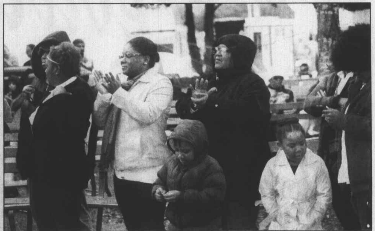
Members of the community both young and old enjoy the 2015 Gospel Fest on Sunday, Oct. 4.

The Gospel Fest will continue next weekend on Sunday, Oct. 11 at 3 p.m. at the Dixie Classic Fair, and with better weather a larger crowd is expected.