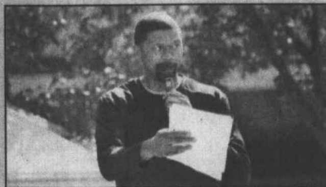
Jalen Rose, sports analyst for ABC/ESPN, hosts the Champion Day fashion show at the HanesBrands headquarters in Winston-Salem on Friday, Oct. 9.

Since 1919 Champion, Athleticwear has offered a full line of innovative athlet-