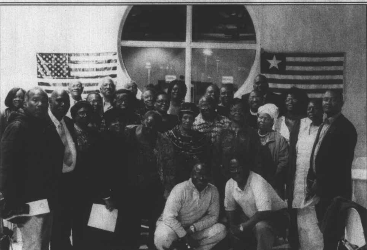
Members of the Liberian community from Winston-Salem, Raleigh area and Greensboro gather at the

528(a). We help people file for bankruptcy relief under the