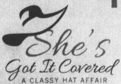
A CLASSY HAT AFFAIR