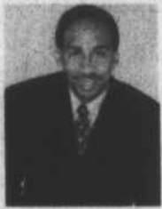
STEPHEN A. SMITH