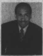
STEPHEN A. SMITH

SUPPORTING SCHOLARSHIPS FOR OUR MEN'S SPORTS