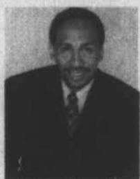
STEPHEN A. SMITH