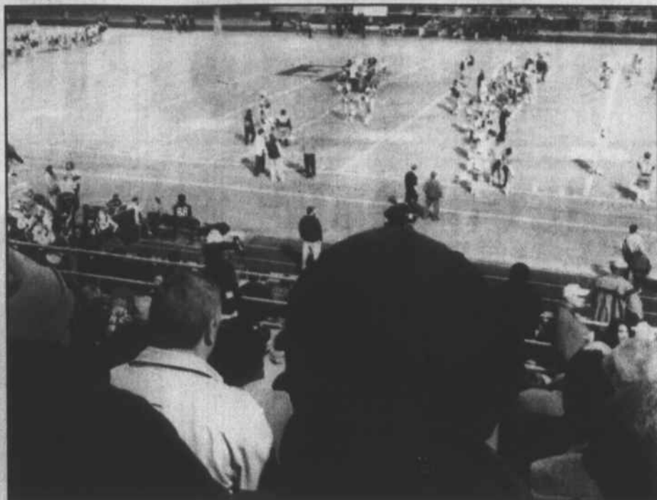
Thousands showed up to see the quarterfinal matchup between cross-town rivals East Forsyth and West Forsyth on Friday, Nov. 27. After dominating the entire contest, the Eagles are one step closer to rewriting the school's history books.