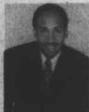
STEPHEN A. SMITH

SUPPORTING SCHOLARSHIPS FOR OUR MEN'S SPORTS