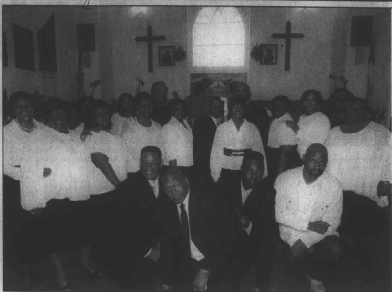
St. Matthew Apostolic Temple Church of Jesus Christ Sanctuary Choir is shown.