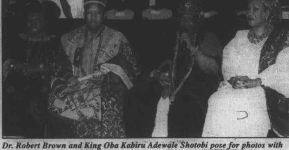
their wives at the end of the ceremony.

A member of the audience said, "This is not an honor that can be bought or