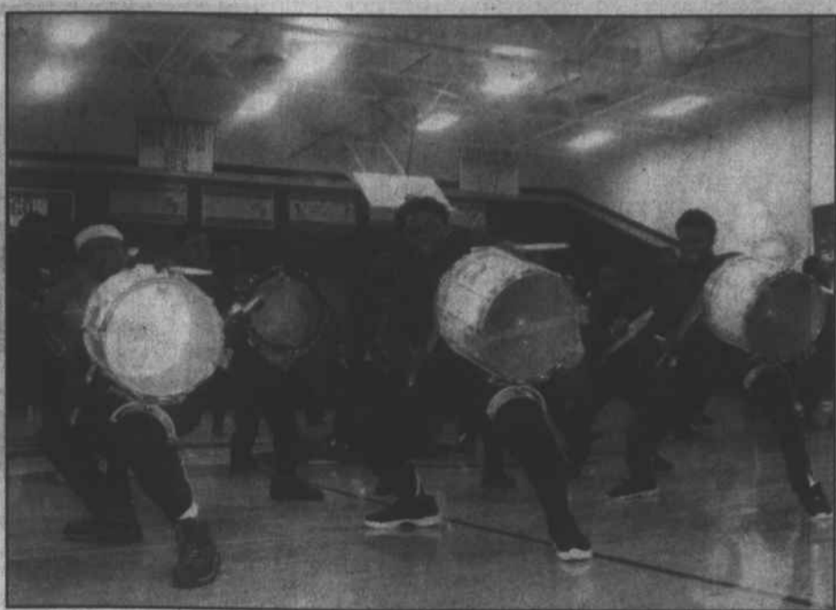
Members of the Mo Lucas Boss Drummers (MLBD) perform during the Tri-City Throwdown on Saturday, March 19 at Carver High School. MLBD is a community drum line from Winston-Salem.

Money raised from ticket sales and concessions will go to the band programs at Aycock and Carver. Following the event a number of parents told The Chronicle that they enjoyed the event because it gave the young performers a