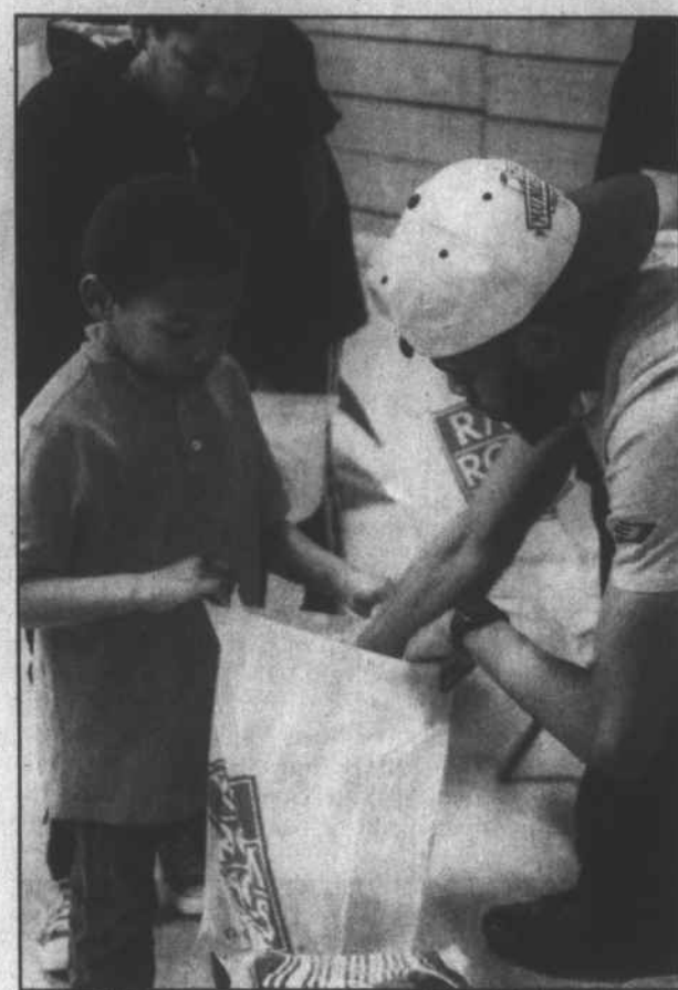
Children receive gift bags from Rack Room Shoes, Shoes That Fit and The Chris Paul Family Foundation

to make sure no child has to miss school because they don't have proper shoes. For more information, please visit us at http://www.shoesthatfit.org