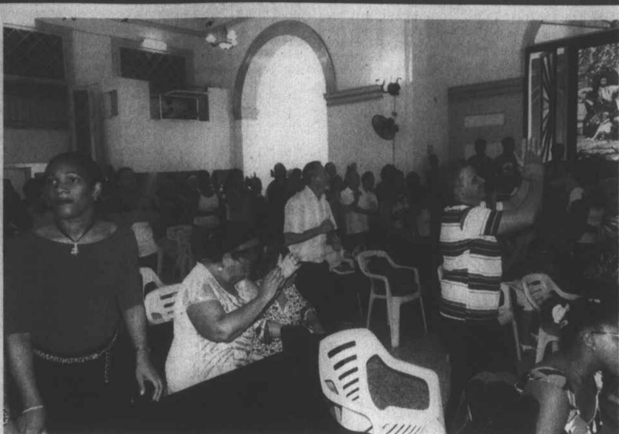
Residents of Cuba enjoy worship service. Local pastors traveled to Cuba to discuss social justice. The delegation was the first to visit Cuba since the establishment of the U.S. Embassy in the country.