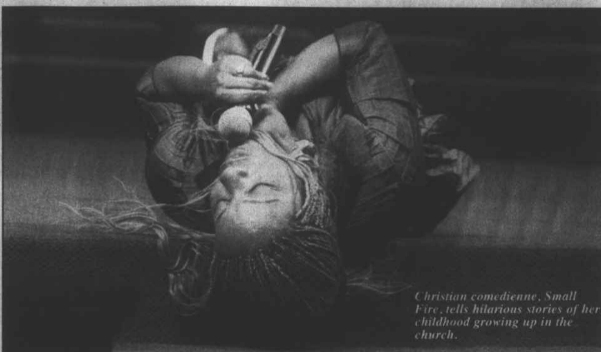
Christian comedienne, Small Fire, tells hilarious stories of her childhood growing up in the church.