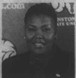
Administrator of the Year Award recipients.

In celebration of the success, achievements and advancement of women leaders, the NACWAA announced July 15 its 2016