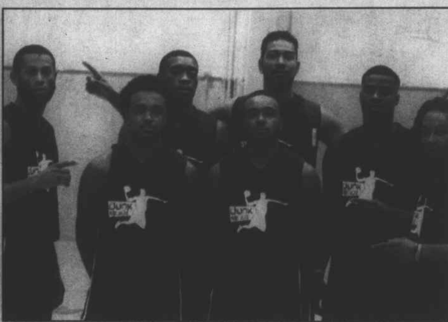
Dunk Godz team members are shown.