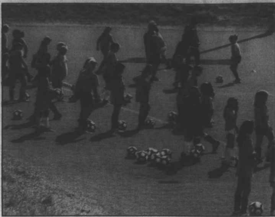
The girls at the clinic practice a dribbling drill to help them control the soccer ball more effectively.