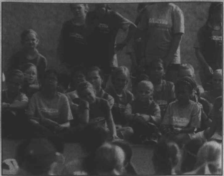
The young women pay attention as they are being shown a new drill during the clinic last Saturday, Aug. 6.