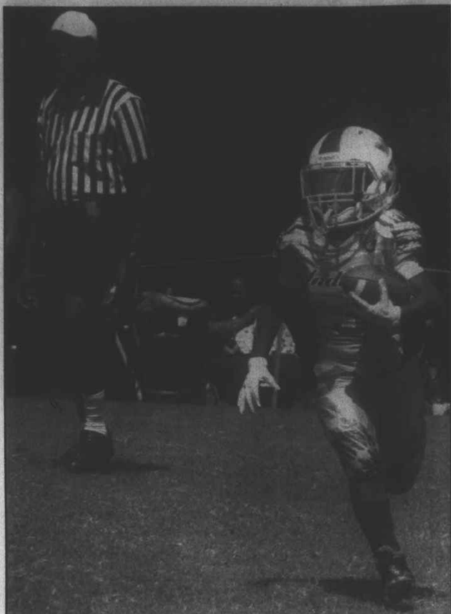
A running back for the Indians, Mitey Mite Gold squad breaks free during a recent game against the Kernersville Raiders.