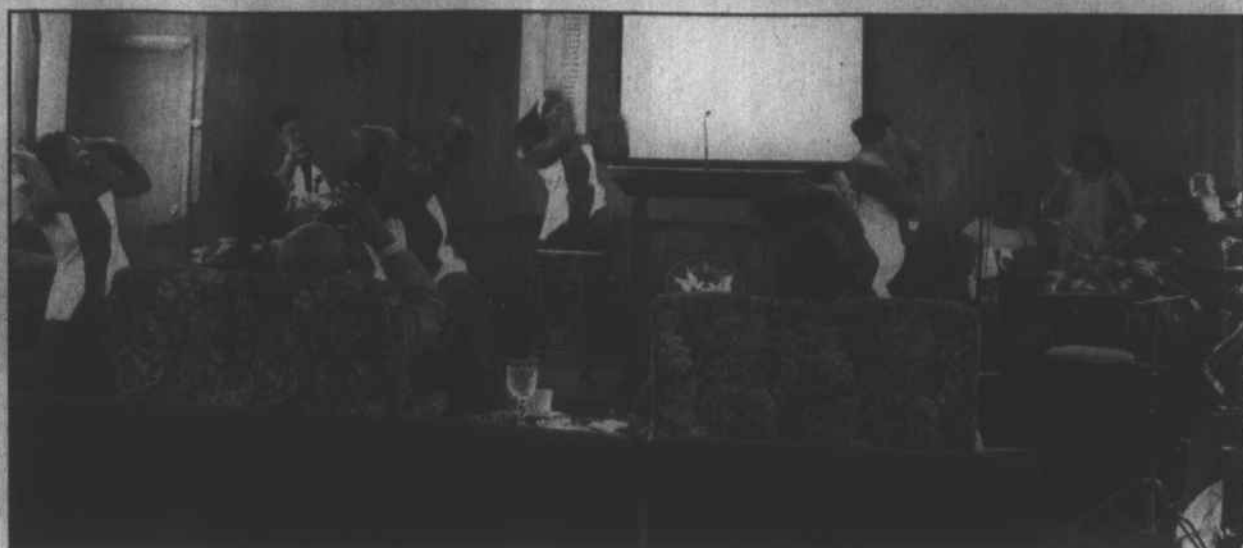
Members of Holy Trinity perform an interpretive dance routine during Sunday's service.

The Inspirational Choir of Mt Zion Baptist Church was founded in 1977 and is currently under the direction of Dionn Owen. Known to the community for its outstanding spiritual and inspiring Poetry and Song Concerts, the choir is also recognized for both traditional and contemporary music.