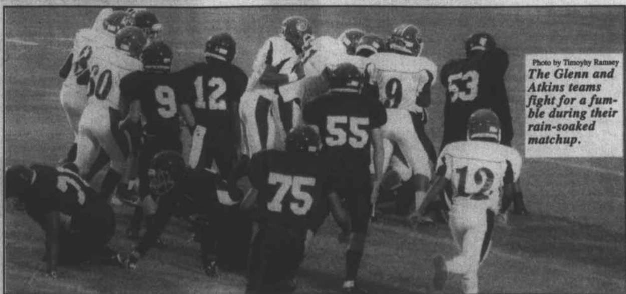
The Glenn and Atkins teams fight for a fumble during their rain-soaked matchup.