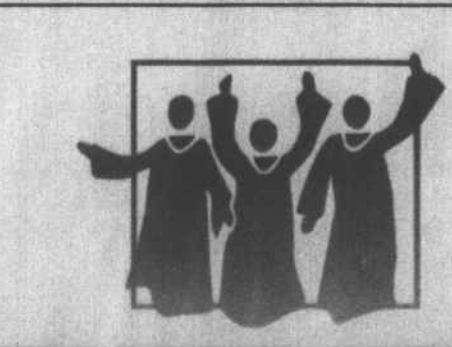
Central Triad Church Worship Team