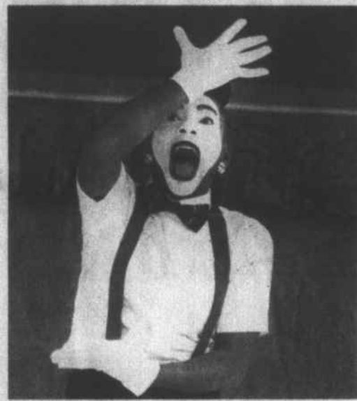
Divine Innocence dance ministry performed a mime routine during the first day of Gospel Fest