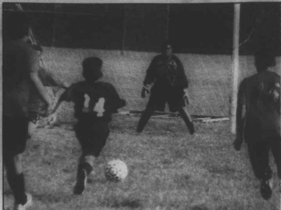
The Northwest goalie prepares to stop a shot on goal from the Walkertown offense.